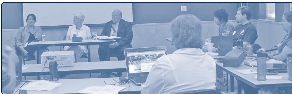
Teachers from across the state gathered at CML to learn more about Lessons on Local Government (see story above).