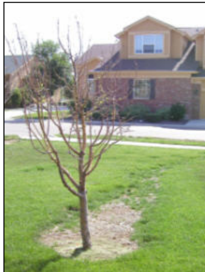
Broomfield, CO – Herbicide Damage