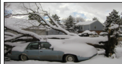
Lakewood, CO – Storm Damage