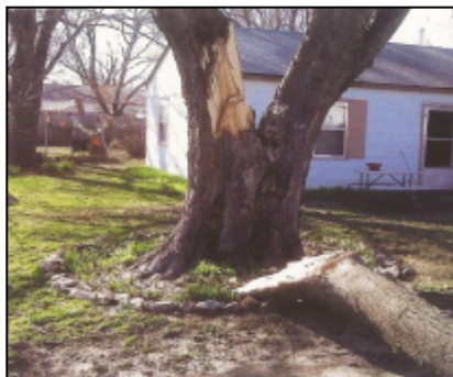
Wichita, KS – Injury by Tree