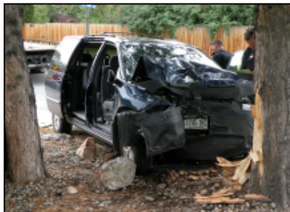
Lakewood, CO – Vehicle Tree Damage

Rely on the best. Demand the knowledgeable experience to support your needs in court or in the field. We welcome your inquiries at any time.