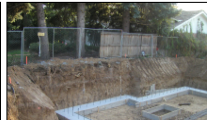
Denver, CO – Construction Damage