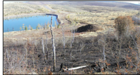
Park City, Utah – Fire Damage